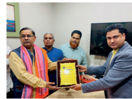
December 31 - Employee Retirement Ceremony