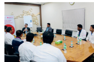
January 17 - Coffee with MD & CEO with Radiology Technicians