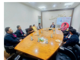
January 16 - Coffee with MD & CEO with Housekeeping, Security & F&B