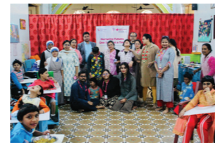
January 10 - CSR Activity at Nirmala Shishu Bhavan (Missionaries of Charity)