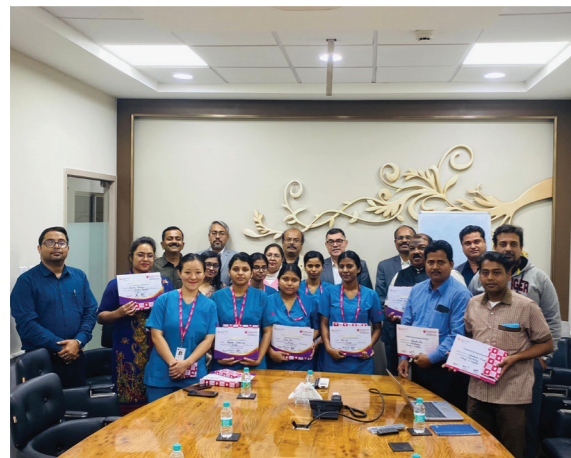
December 27, 2024 - R & R program